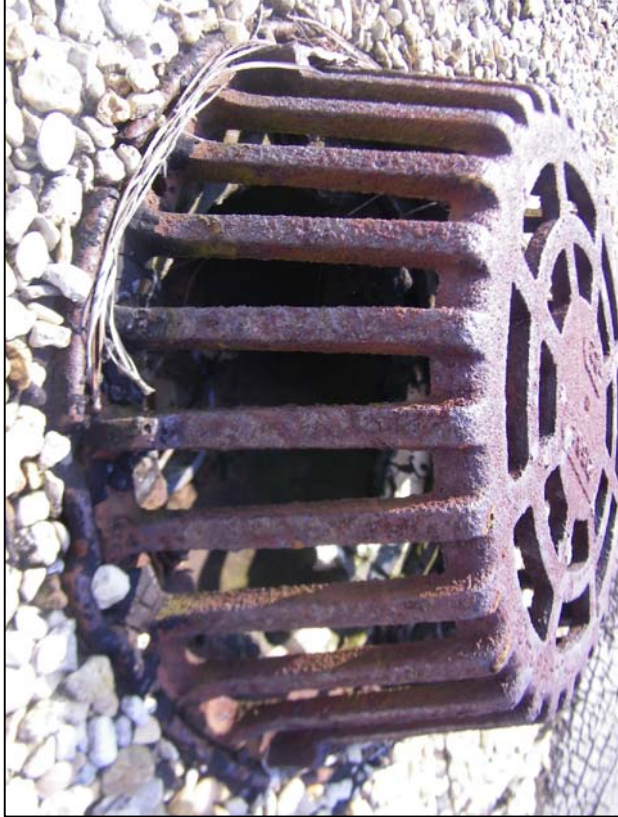
EXISTING BLDG. A (#1966) ROOF PHOTOS N.T.S.